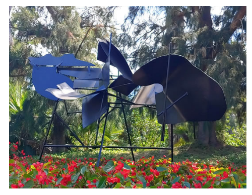
Located at Tram Road & Alpine Lane