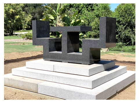
Located in Phoebe's Meadow