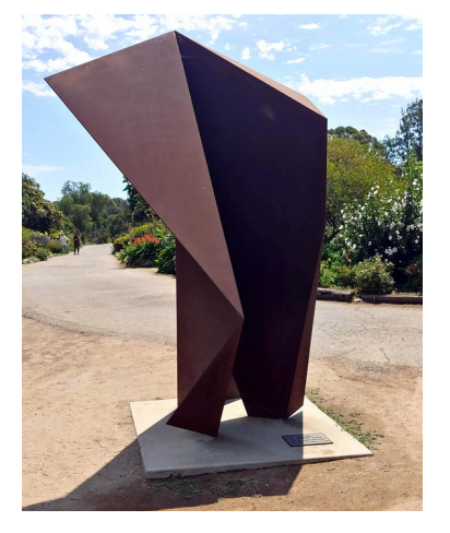
Located near the Children's Garden