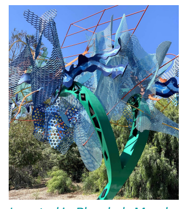
Located in Phoebe's Meadow