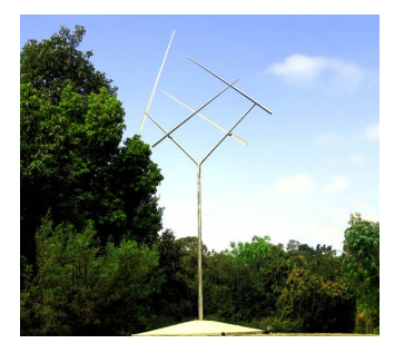
Located in Hawk's Meadow

• Can you make yourself look like the sculpture and move with the wind?